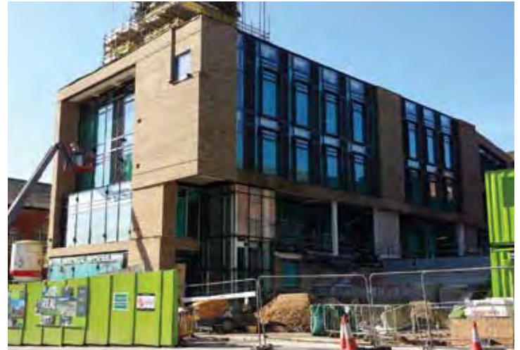
Removal of the scaffolding to provide the first glimpse of the new central library and archive