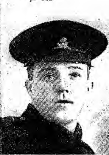
West Town Pte. 1/5 DorW Killed 3Jul1916 p. 454