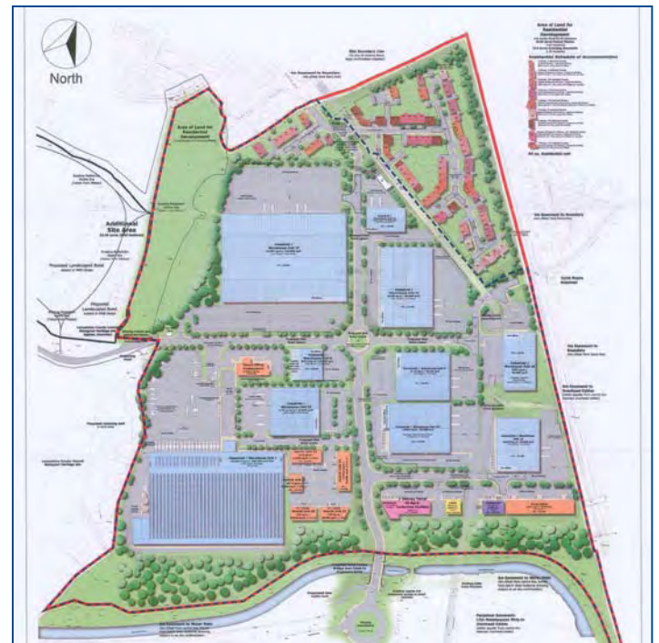
Burnley Bridge Masterplan (App. No. 2008/0805)

Burnley Bridge Business Park is a large commercial development set within 70 acres of former industrial land located on the southern outskirts of Padiham, 4 kilometres west of Burnley town centre adjacent to Junction 9 of the M65. The site slopes from the south to north with a raised embankment on its southern boundary.