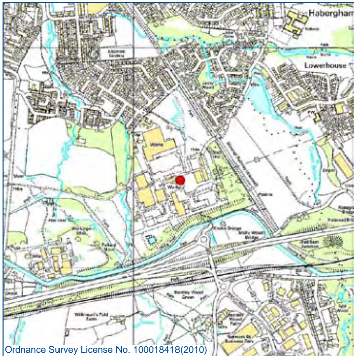
Ordnance Survey License No. 100018418(2010)

The development was granted outline planning in 2008/9.