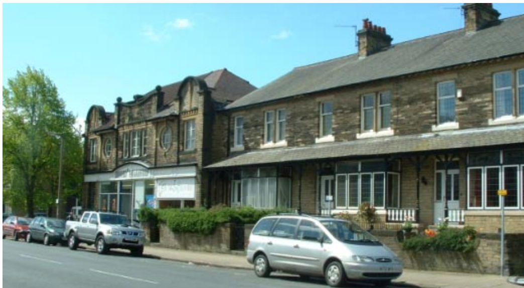
The former Halifax Industrial Society shop and terraced houses, Skircoat Green Road

The local shopping area at the south end of Skircoat Green Road features a range of properties some purpose built as shops some converted from terraced houses with inserted shop fronts.