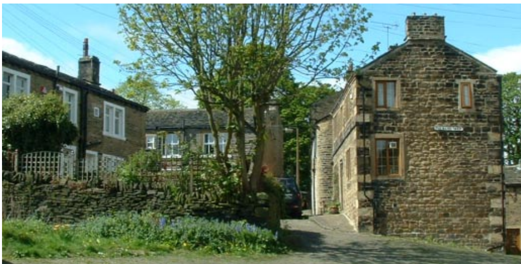
Cottages near the green, Skircoat Green

This Conservation Area Character Appraisal defines and records what makes the area around Skircoat Green an "area of special architectural or historic interest". This is important in providing a sound basis for local plan policies and development control decisions, so ensuring that these decisions can be defended if there is an appeal against a refusal of planning permission. The appraisal will also guide the formulation of proposals for the preservation and enhancement of the appearance of the area. The clear definition of what makes this area special, and therefore of what it is important to retain, also helps to reduce uncertainty for those considering investment or development.