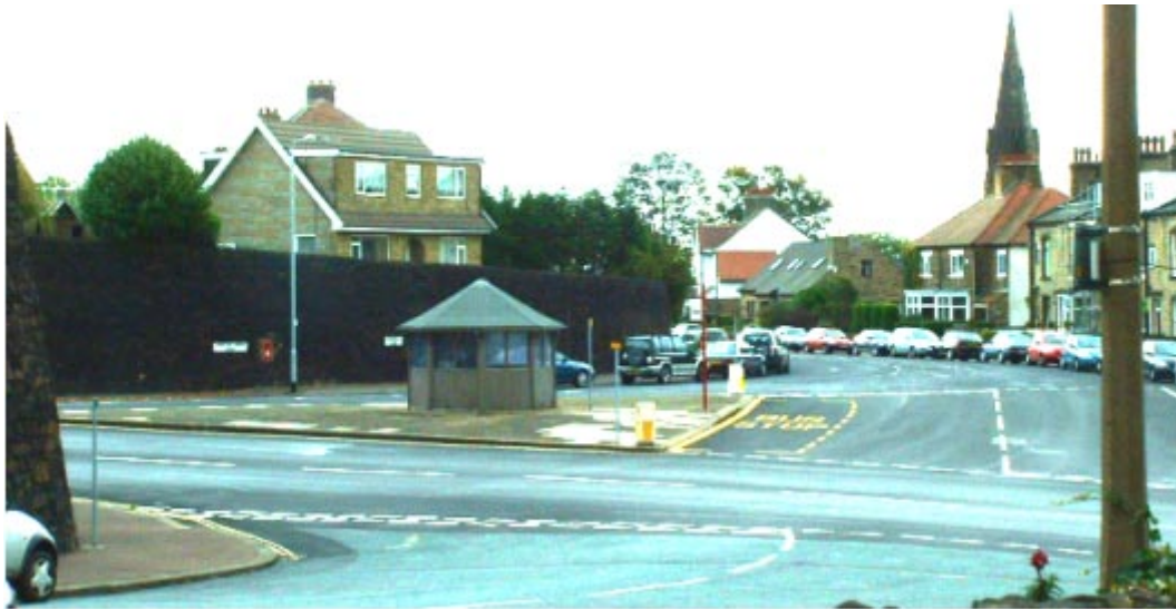
Former tram terminus – the shelter was removed May 2005

The special characteristics of this area include: