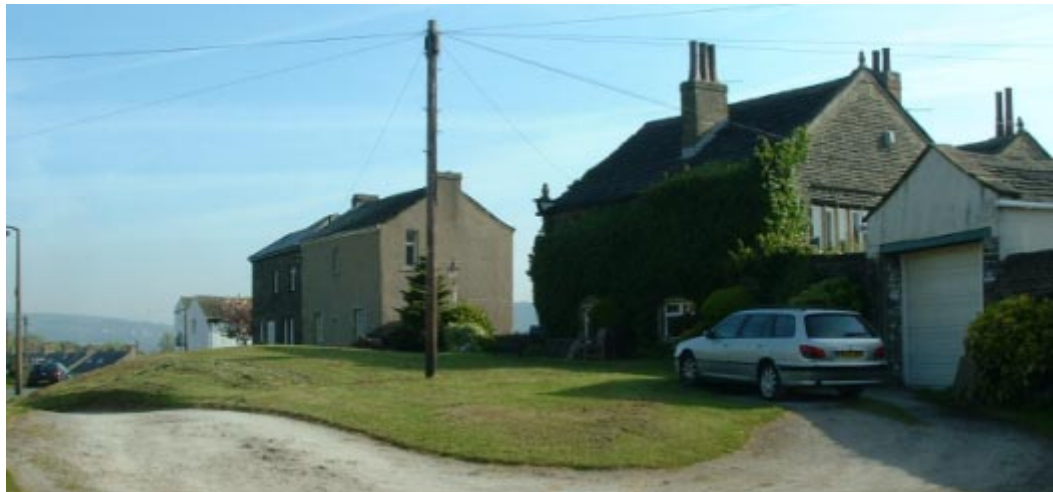
Looking north east over the green

While individual properties in this group of early vernacular properties retain many of their original features, the character of the area has been affected by the painting of the external walls of properties on the north east side of the green and the development of a large block of flats within the former grounds of Bermerside, which is out of scale and too close to the estate boundary. This forms a dominant element in the street scene. Pressure to find off road parking spaces is also affecting the grassed areas leading to loss of visual quality.