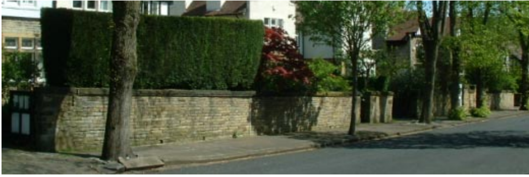
St Alban's Road

Throughout the proposed conservation areas property boundaries are typically defined by walls. They divide the building plots from the street and are one of the distinctive characteristics of this area. Front boundary walls vary in height in relation to the size of the property. The smaller terraced properties have lower walls, typically less than 1 metre high, and there is evidence that many of these walls were formerly finished with railings, many of which were removed during the 1940s as part of the war effort. The larger properties have higher front boundary walls, typically around 2 metres in height, to maintain privacy. In most cases rear boundary walls are also around 2 metres high. Trees and shrubs are often planted against the front walls of properties and the containment which results from this and the associated enclosure of the street scene emphasises the separation between public and private space. In the area to the north of Lawrence Road high garden walls turn the corners from road to road and while in almost every case the original boundary gates have been removed or replaced, a considerable number of original gate piers remain.