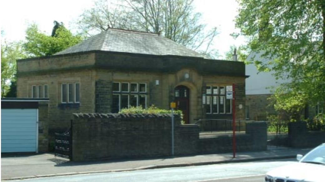
Skircoat Green Library, Skircoat Green Road

Built in 1926 of coursed stone, with a parapet surrounding a blue slate hipped roof with terra cotta ridge tiles and finials, this was the first purpose built library building in Halifax.