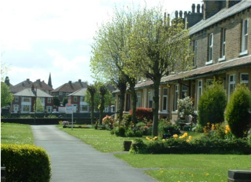
View along Belvoir Gardens towards the rooftops of the Green Park estate and All Saints' church spire