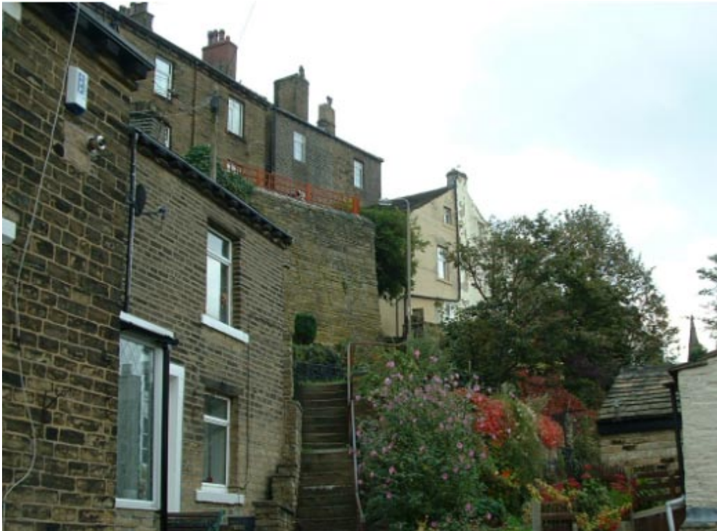
Cottages at Lower Skircoat Green

This area of vernacular cottages retains much of its original form and detailing. Built at different levels with attractive setted lanes, stone pedestrian paths and steps it is characterised by a random arrangement of buildings with small garden areas fitted in between, unified by use of common materials and simple detailing of elevations.