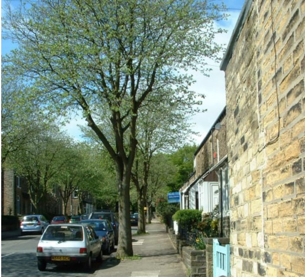
Street trees - St. Anne's Road