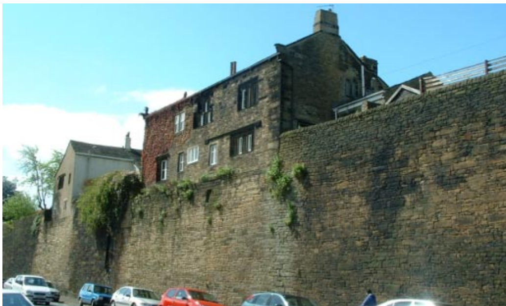
17th Century houses perched above Dudwell Cutting

The striking cutting with high stone retaining walls, known as Dudwell Cutting was excavated around 1898, the work being undertaken as an unemployment relief scheme. This changed the face of Skircoat Green and created a link with Dudwell Lane.