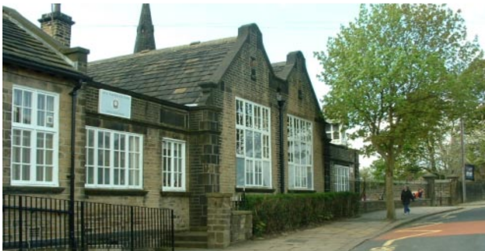
All Saints' School

Designed by Walsh and Nicholas in 1904. Many local vernacular details are featured including coped gables with kneelers, prominent keystones and quoins, and stone slate roof. The clock turret is probably a later addition. There are interesting stained glass windows showing sports activities. Unfortunately late 20th century additions, while in keeping with the massing of the building, are not of the same architectural quality.