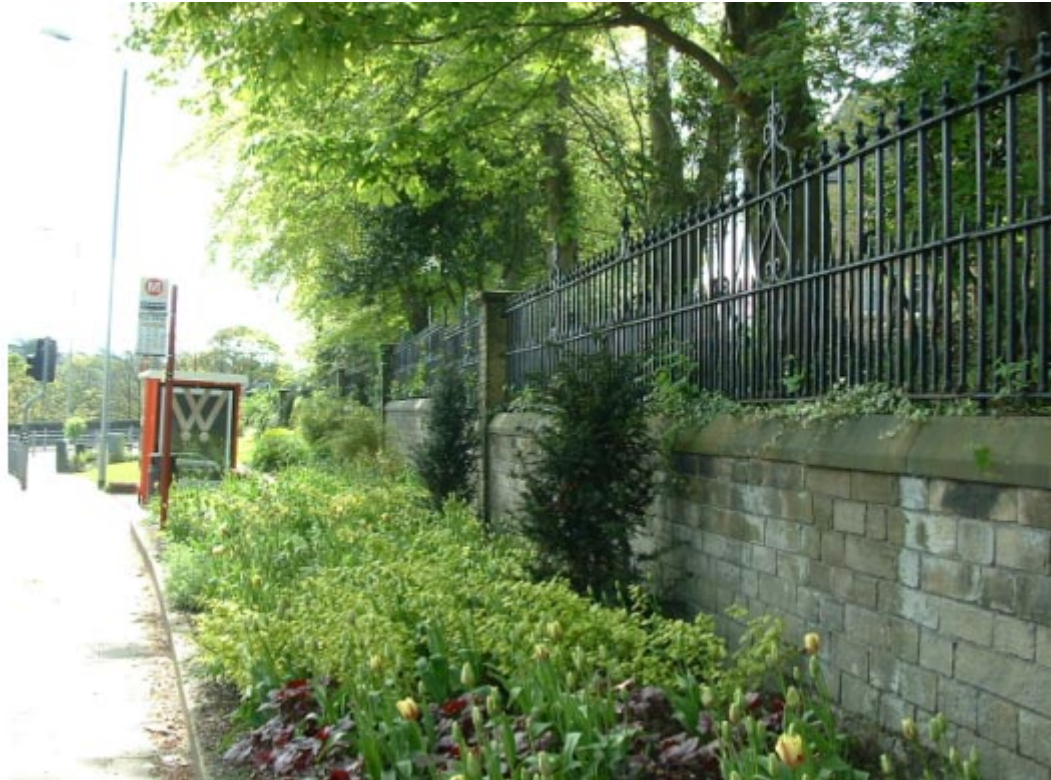
Huddersfield Road - trees in the grounds of the hospital

Street trees play an important part in defining the character of the proposed Skircoat Green Conservation area, together with mature trees within grounds. The location of key trees is set out below.