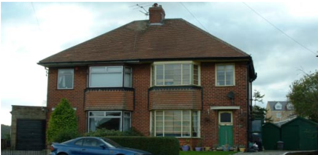
Green Park - the house on the right still has its original door and windows

Lying between Godfrey Road, Skircoat Green Road and Dudwell Lane this planned development of semi-detached properties with front and rear gardens retains its original road and plot layout and building line. While the variety of materials and styles of wall and fencing used to mark front boundaries detracts from the visual character of the area, the wall and roof materials, roofscape and massing of the houses remains much as original. However care needs to be taken to ensure that character is not eroded by inappropriate infill, particularly where this means subdivision of gardens.