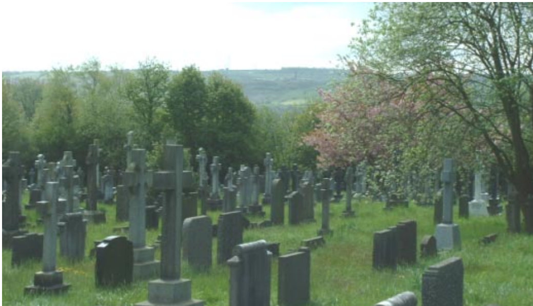
View to distant hill side from All Saints' Burial Ground

The burials ground lies to the east of the All Saints' Church and to the south of Dudwell Lane. Entrance is from Dudwell Lane with a linking path from the church. The main drives are set out in a cruciform pattern, with a circular bed at their crossing point. Lesser paths run parallel and at right angles to these. A further drive sweeps informally around near to the eastern boundary. Of particular interest is the Holdsworth family mausoleum.