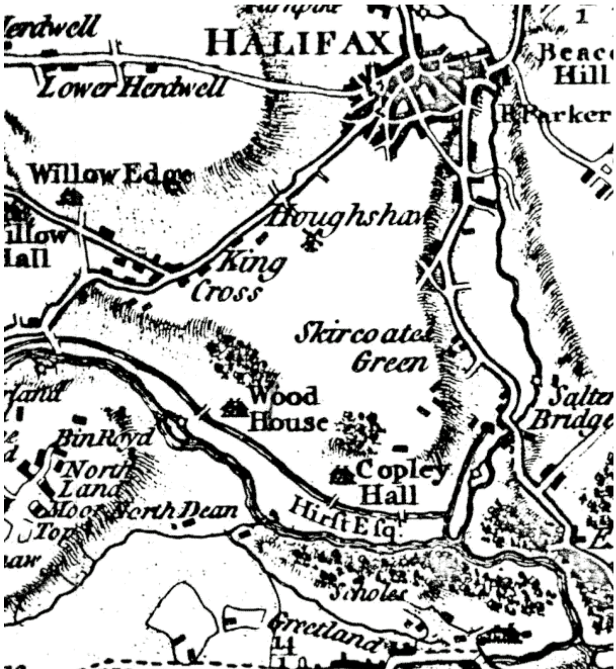
Thomas Jeffery's map of 1775

Industrial development in and around Halifax was concentrated along the Hebble Valley and the steep slopes that constrained physical development into a pattern of predominantly westward expansion in the 18th century and 19th century also set limits on the town's growth in the 20th century. Halifax became a County Borough in 1848 and the Borough's boundaries were extended in 1865 to include Skircoat, however, these steep gradients and the rugged physical terrain meant that Halifax remained a predominantly pedestrian town until the development of electric tramways and motorised transport post 1898.