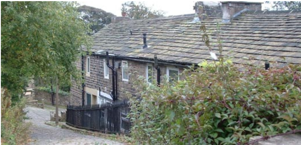
Cow Lane - note stone slate roofs, stone setts and original metal railings