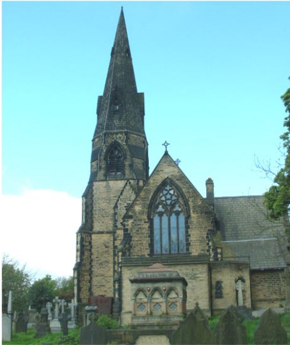
All Saints' Church of England Church