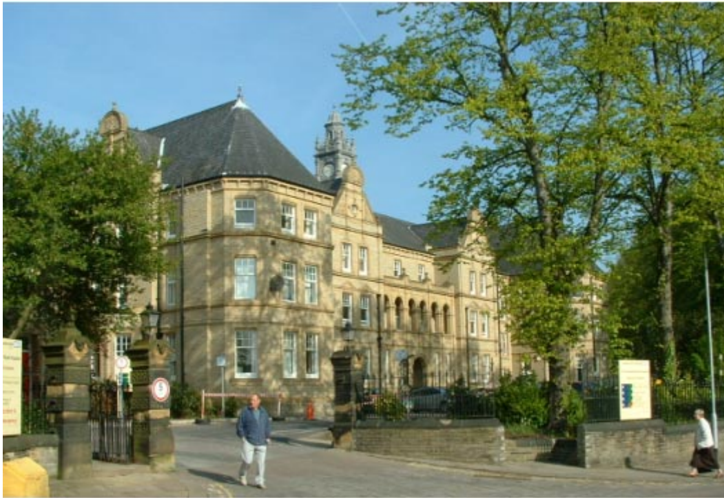
Calderdale Royal Hospital