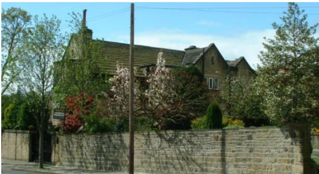
The Croft, Rawson Avenue

With its wide roads and large properties behind high boundary walls this quiet residential area is characterised by individual buildings of quality, built in a variety of styles and materials, and an air of privacy. Some properties front onto the road and some have their principal elevation at right angles to the road. Plot sizes are small for the size of property giving little scope for further infill development.