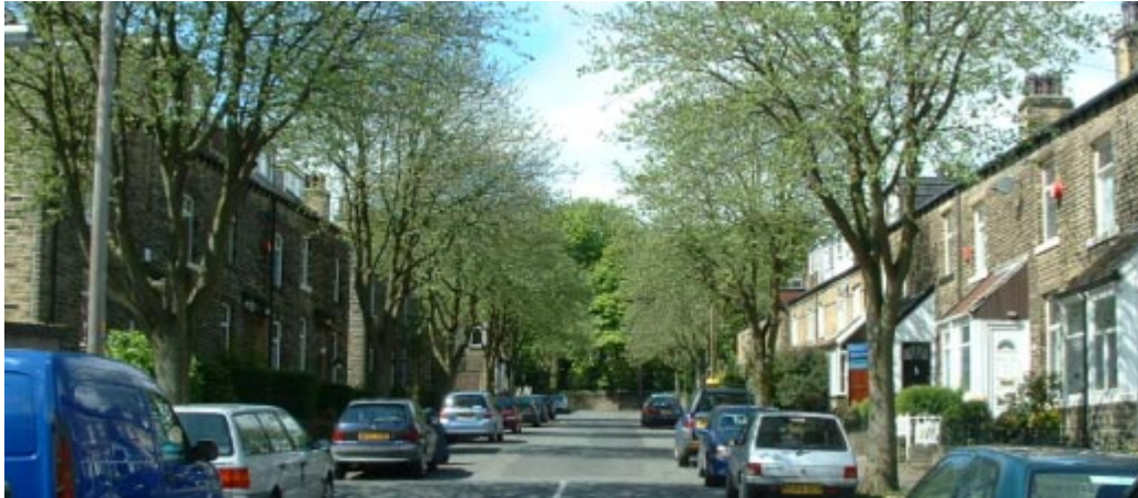
St Anne's Road

Mainly terraced properties, with stone front boundary walls creating a unified street scene.