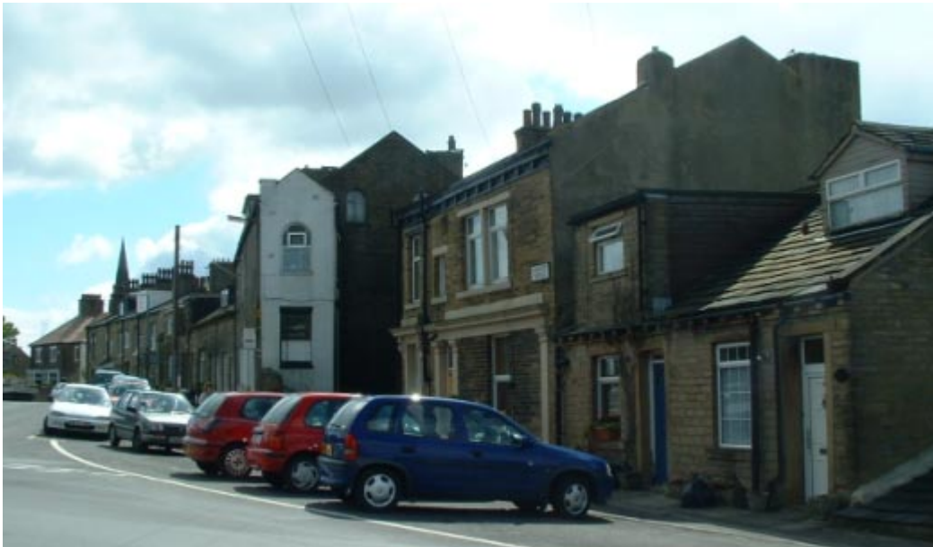
Dudwell Lane near the junction with Skircoat Green Road

There is the potential to upgrade the environment of the area by :-