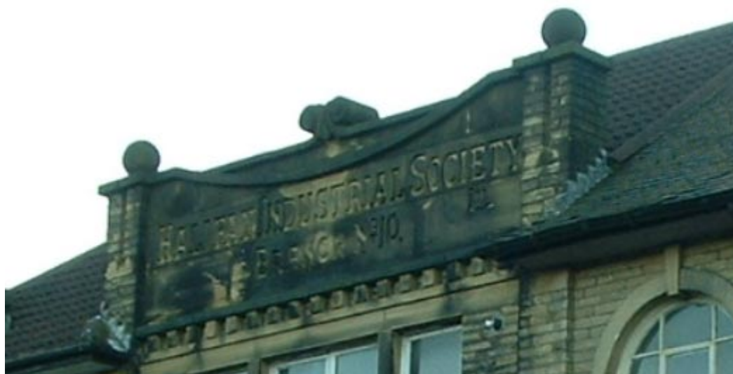
Above the former 'Co-op' shop, Skircoat Green Road

Many chartists went on to be early members of the Co-operative movement and in 1850 the Halifax Working Men's Co-operative & Provident Society was established. This became the Halifax Industrial Society in 1861 and a Skircoat branch was opened in 1862.