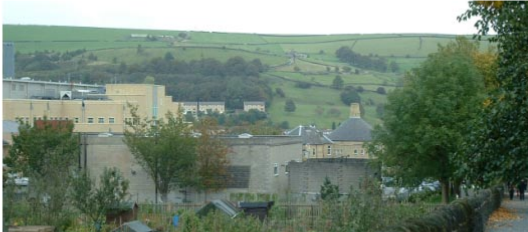
View from Godfrey Road looking east over the hospital