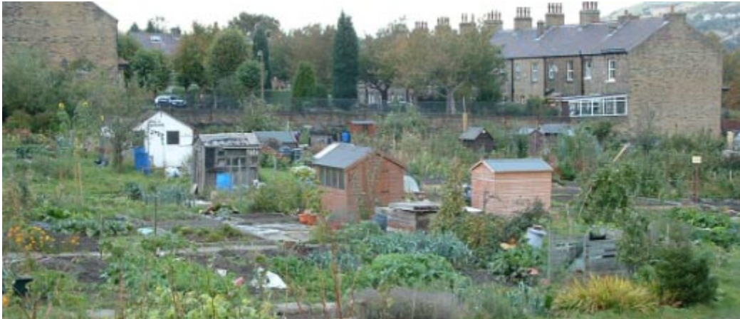
View over the allotments towards Haddon Avenue and Belvoir Gardens

The 1907 Allotment Act which imposed a responsibility on councils to provide allotments and those at Godfrey Road date from the early 20th century.