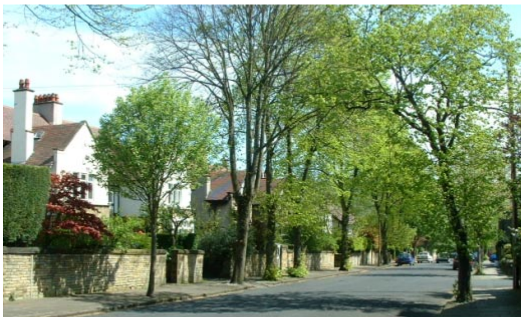
St Alban's Road