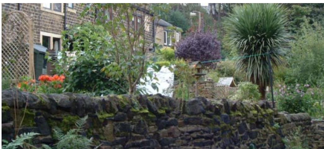
Lower Skircoat Green

The cottages at Lower Skircoat Green built down below Copley Lane are served by lanes, some setted, some tarmaced and some unsurfaced, all running parallel with the slope and linked by several sets of stone steps up to Dudwell Lane . Gardens are bounded by drystone walls.