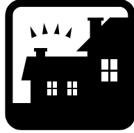
TABLE B Extensions to single dwellings