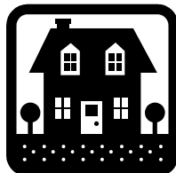
TABLE A Standard Charges for the Creation of New Dwellings