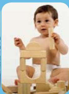
Enjoying and Achieving