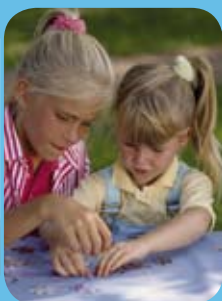
Making a Positive Contribution